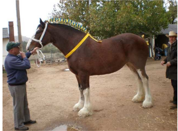
Moss Rose as a Shire!