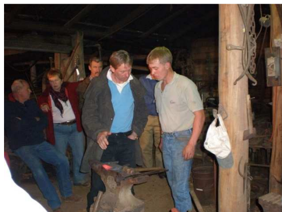
More work on the shoe...