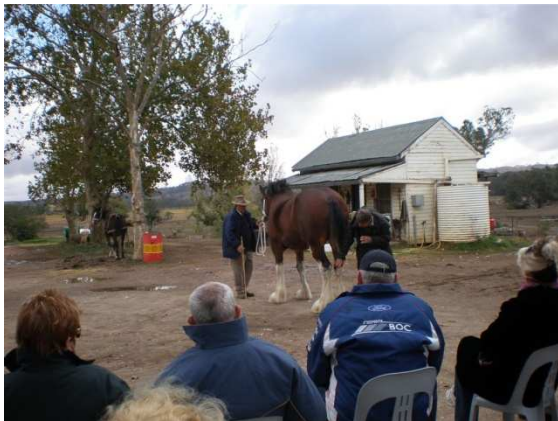
Points of a Clydesdale